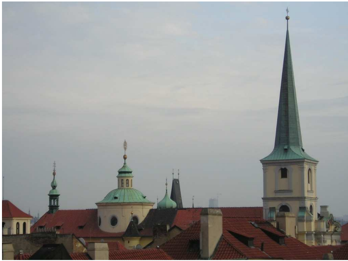
St. Thomas Church: established July 1, 1285 by King Vaclav II